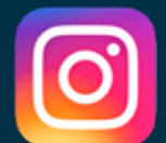
Photo Gallery of FLC Events