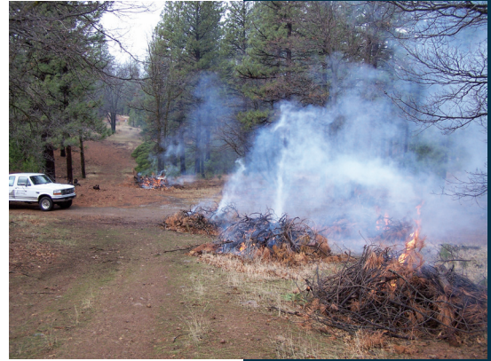
Burn piles in the open in shaded fuel break

Remember, the reason for doing this is fire safety, don't get carried away and negate your efforts by an out-of-control fire. Done properly, FMZs along all your major roads are very appealing, with trees pruned and well-spaced and ground fuels eliminated. They are quite literally the best form of insurance your property can have.