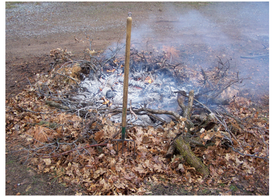
A pitchfork is a necessity to "chunk in" unburned slash for a complete burn

Fuel Management Zones (FMZs) are areas where the flammable brush, high grasses and "ladder fuels" are removed to create a safer zone. In these areas, start by thinning the mid-size trees within 25-50 feet of the road to reduce tree densities to an acceptable level. Follow up by removing the ladder fuels, those sub-merchantable trees that a fire can climb to reach the crowns of larger trees. Finish by constructing a turn-around for fire trucks at road ends.