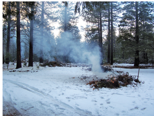
Safest way to burn - surrounded by snow.

Slope is also a key parameter in assessing how quickly a fire can spread. Fire spreads much faster uphill than downhill, so plan your strategy to allow for this. Look for areas that can be treated to reduce overgrown vegetation, wind-fallen trees and other lower elevation areas that could contribute to a fire's spread. An access road to an upwind area that is a low elevation should receive a high priority.