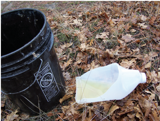
Plastic bucket with alumagel and a handy scoop made from a one gallon plastic jug

Burning slash piles can be very hazardous and should only be attempted by those who both understand and respect how fire behaves. Those of us who do our own burning can provide MANY instances where fire became uncontrollable within a short period of time. Anticipating the factors that lead to uncontrollable situations usually spells the difference between a successful and not-so-successful burn operation. Needless to say, the winter periods with snow on the ground can be the best from a safety standpoint, but difficult from an ignition standpoint.