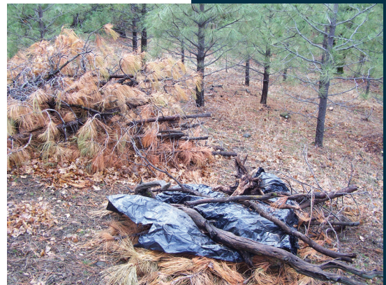
Placing plastic on a dry slash pile makes burning easier in wet weather

Everyone has their favorite method of igniting wet, hard to burn piles. I have heard of toilet paper rolls dipped in diesel fuel, drip torches, fatwood bundles and propane torches, but my all-time favorite method involves EZfire. This dry powder product was originally known as napalm in World War II, transitioned to alumagel in the 1970s and is now sold under the EZfire brand name. It is a white powder that is mixed with gasoline to create a jellied solution that burns with an intensity that cannot be created by gasoline alone. A Google search reveals Western Helicopter Services now sells the product in the smaller quantities needed by landowners [ www.westernhelicopterservices.com/EZfire.html ]. A plastic bucket of EZfire