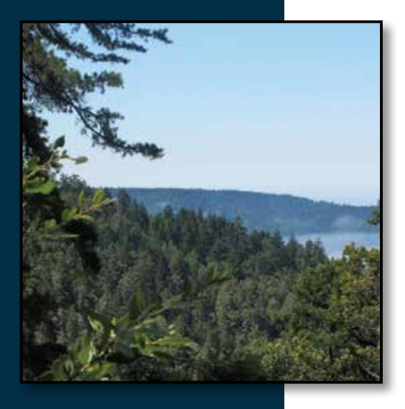
Fog in the Garcia River Canyon