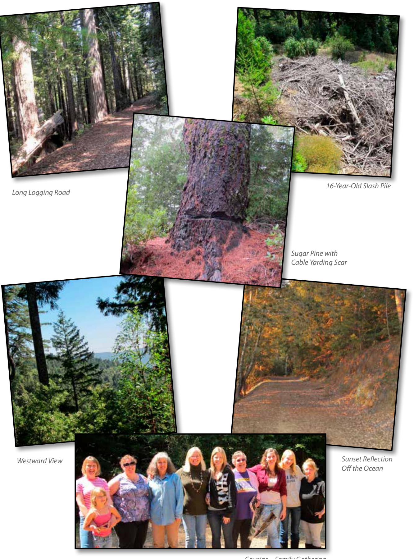
Cousins – Family Gathering