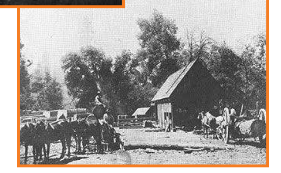
Ed Phillips' original mill built in 1897-98