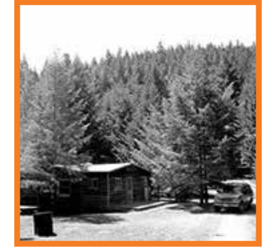
1988, after three harvest cycles