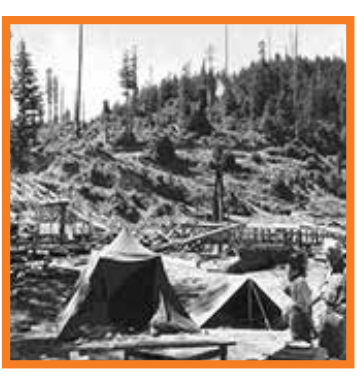
1958, shortly after purchase

There is a form on the FLC website you can use to submit a question. We are building a library of FAQs. Send us your question – it might help another landowner. Or, send your question by traditional mail – we will send you a response.