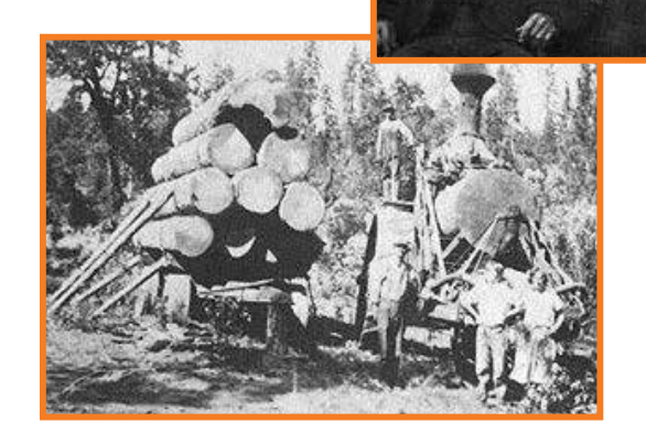
Logging in the woods, 1929