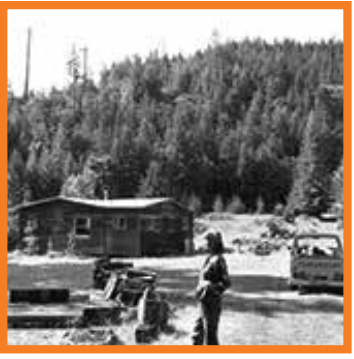
1978, six years after first selective harvest